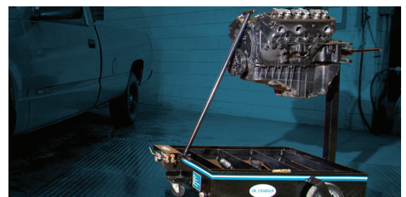
Engine stand shown