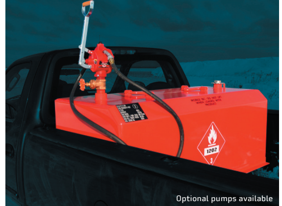
Optional pumps available

"This high-quality product undergoes a series of tests and is built to last. Proud and dedicated workmanship goes into the fabrication of every tank."